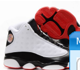
Air Jordan 13 Retro shoes black white ID:6390 Free Shipping